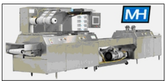
The 8000 MH Thermo Form Fill Seal Machine from Ossid. <sup>4</sup> Alternatives available from Multivac<sup>5</sup> and others

The 8000MH Thermo Form Fill Seal Machine from Ossid (formerly known as Mahaffy & Harder) is a typical machine for making saddlepacks.